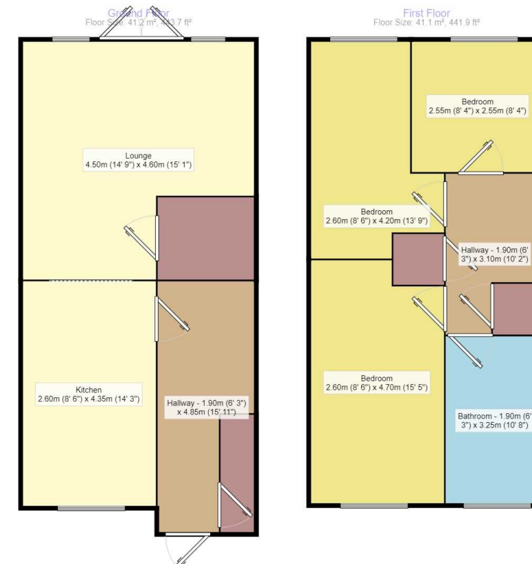
Measurements are approximate. Not to scale. For illustrative purposes only.